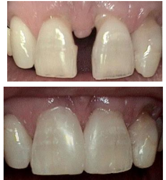
Before and after pictures of a space closure with composite bonding.

Are you tired of hiding that embarrassing space between your front teeth? Luckily, we offer a few choices for space closure that may enhance your natural smile. One option is veneers. A veneer is a thin piece of porcelain bonded to a tooth to improve esthetics. A veneer allows you to change the shape, color, size or length of a tooth. When veneers are completed on multiple teeth, they can be used to visually improve the alignment of the teeth. Veneers are highly esthetic and allow for the most change with predictable long-term results. Another option for closing the space is to do in-office composite bonding. Composite is a tooth colored filling material that is bonded to your tooth to change the contours and esthetics of the tooth. Composite is plastic based and is not as durable as porcelain, however it can provide for great shade matching and improved contours and esthetics. Every smile is different, so let us know at your next visit if you would like improve your smile and we can find the best option for you.