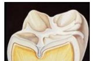
After sealant application