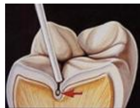
Before sealant application